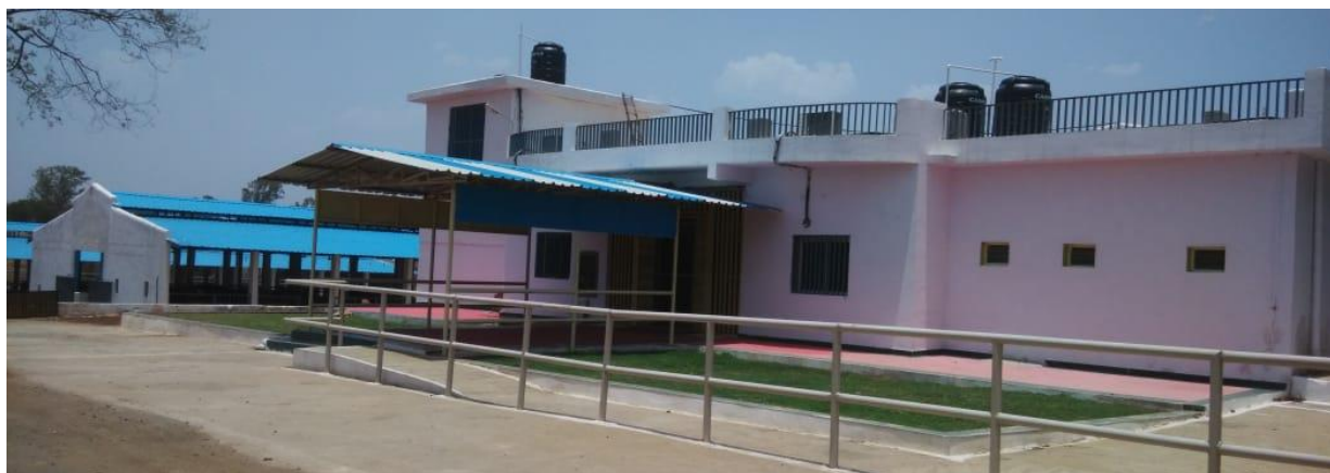
Bull sheds at CSS, Bhopal renovated under RKVY

& HF), 2 Cross breed (of these exotic breeds), 2 buffalo (Murrah & Bhadavari) and 4 indigenous (Sahiwal, Gir, Nimari & Malvi) and the production was around 18.34 lakh semen doses.