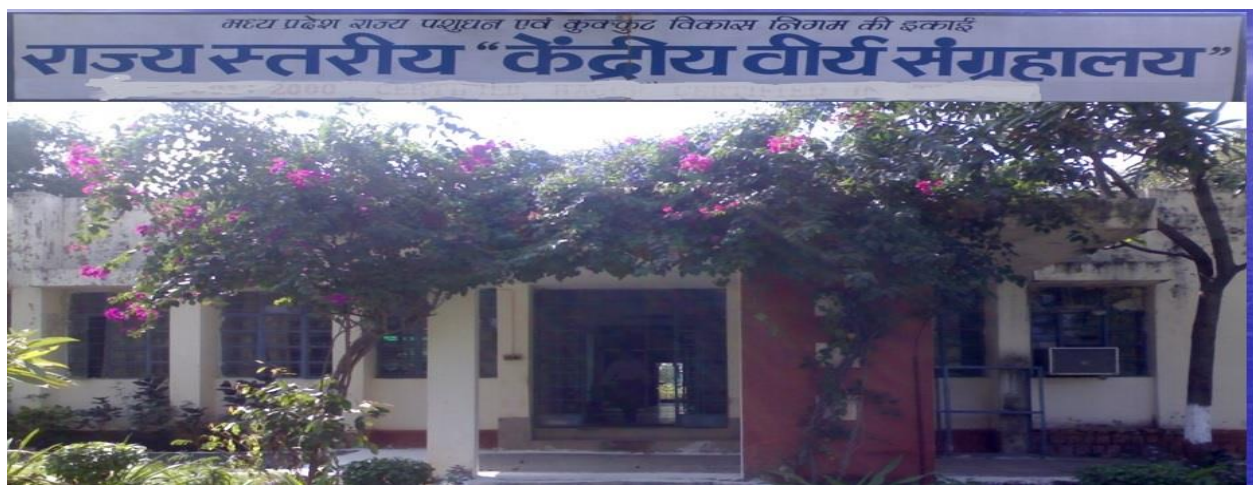
Central Semen Station, Bhopal since 1964

CSS, Bhopal was established in the year 1964-65 with pure breed Jersey & cross breed (Jersey cross Sahiwal) F1 bulls to cater the cross breeding needs of the State. Semen production during 2001-02 was 5 lakh doses whereas the breedable females available in the State were around 110 lakhs with mostly indigenous and non-descript animals. The preferred semen was that of pure-bred Indian breeds.