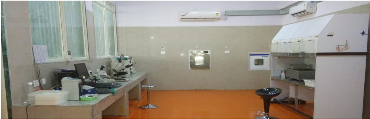
Semen lab renovated under RKVY

the basis of Central Monitoring Unit (CMU) 'A' Grade certified by Govt. of India, Institute. And Semen is being supplied not only to Madhya Pradesh but to seven